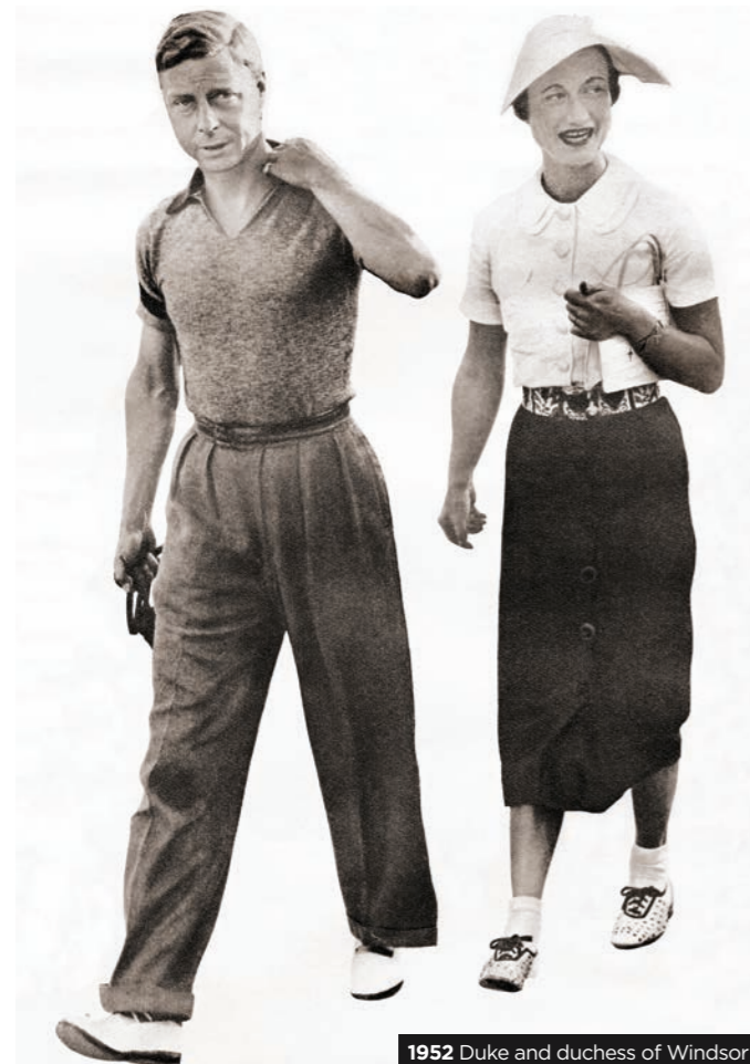
1952 Duke and duchess of Windsor

"He wrote with painful honesty about the abdication crisis"