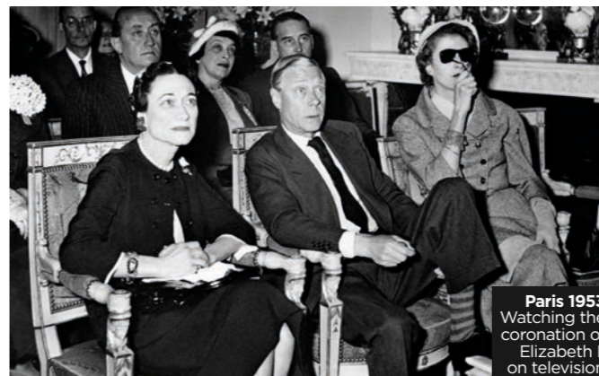
Paris 1953 Watching the coronation of Elizabeth II on television

time who oversaw the project. But some of the best of them come from the duke himself.