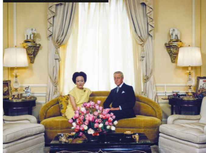
New York 1966 Waldorf Astoria Hotel